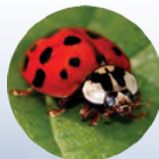
ASIAN LADY BEETLES