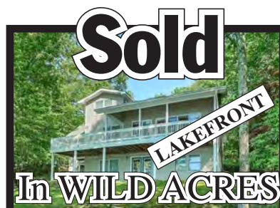
Sold for Ruisi Family Trust