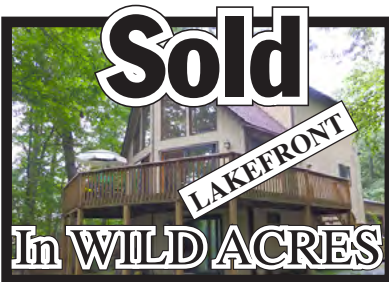
Sold for the Wares

All Listings Get VIRTUAL TOURS by Matterport