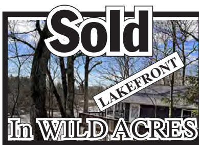
Sold for McGrann & Huff