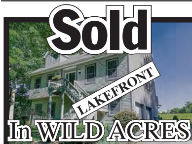
Sold for Cynthia Casale