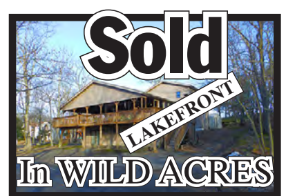
Sold for the Brummers