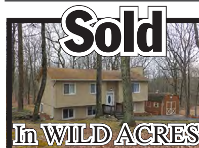
Sold for the Dusenberys