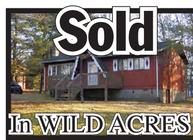
Sold for Emilia Palombit