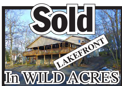
Sold for the Brummers