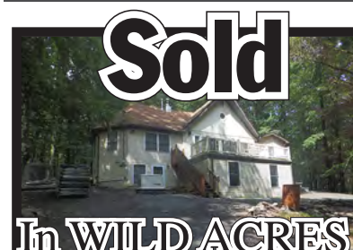
Sold for the Farnsworths