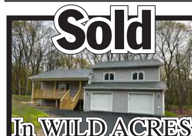
Sold for the Kraminskiys