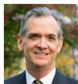
Mayor Sean Strub