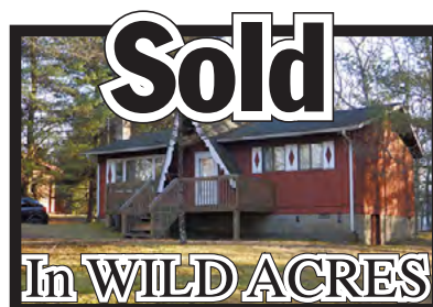
Sold for Emilia Palombit