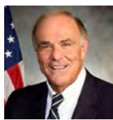
Former Governor Ed Rendell