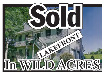
Sold for Cynthia Casale