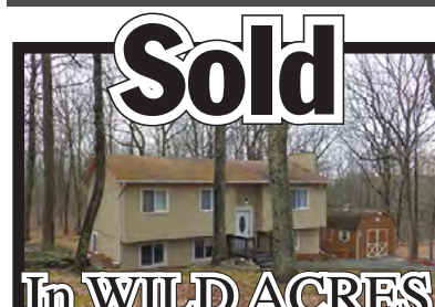
Sold for the Dusenberys