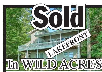
Sold for Ruisi Family Trust