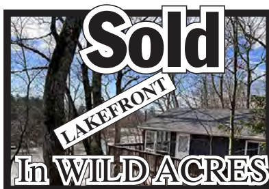
Sold for McGrann & Huff