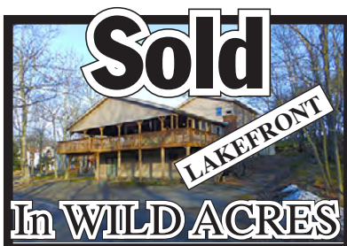
Sold for the Brummers