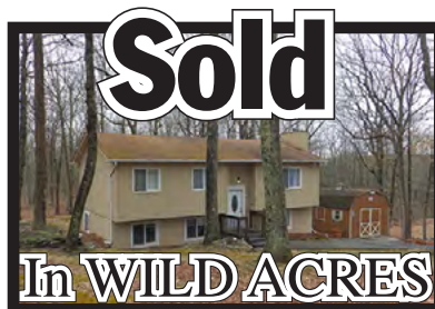
Sold for the Dusenberys