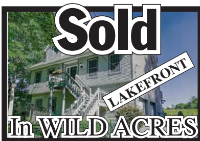
Sold for Cynthia Casale