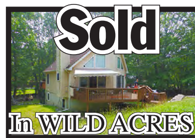
Sold for the Meystelmans