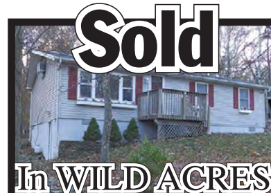
Sold for the Devires