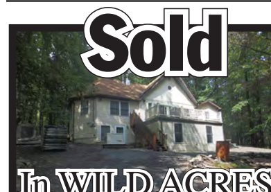
Sold for the Farnsworths