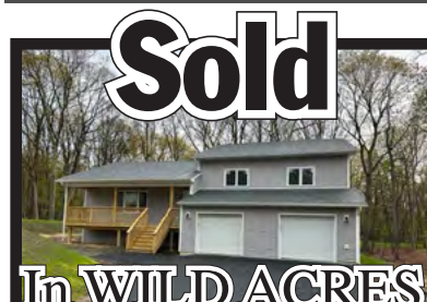
Sold for the Kraminskiys