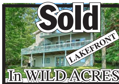
Sold for Ruisi Family Trust