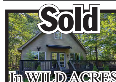
Sold for Carbone & Powell