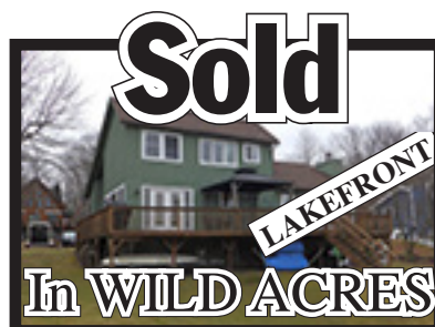
Sold for the Sperandios