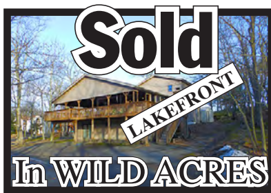
Sold for the Brummers