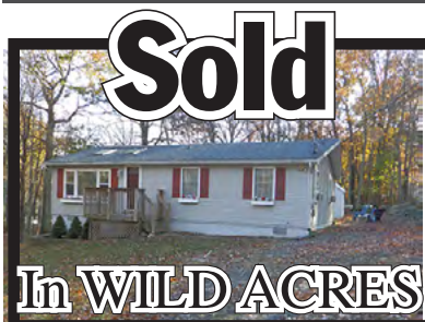
Sold for the Devires