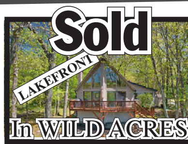
Sold for Kevoian Trust