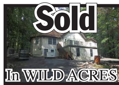
Sold for the Farnsworths