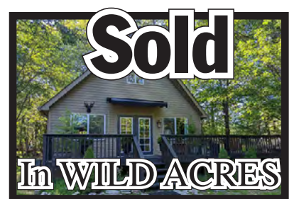
Sold for Carbone & Powell