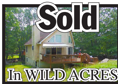
Sold for the Meystelmans