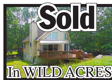
Sold for the Meystelmans