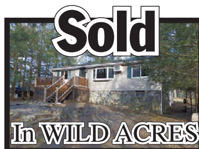
Sold for the Congius