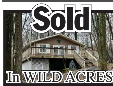
Sold for Benjamin & Campbell