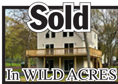
Sold for the Kraminskiys