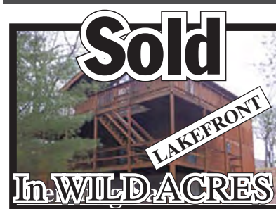
Sold for the Estate of Cattone