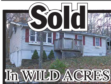
Sold for the Devires