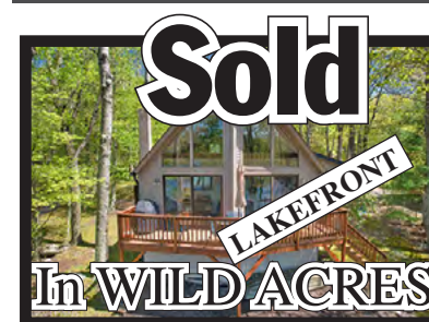
Sold for Kevoian Trust