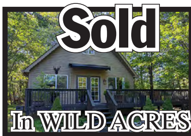
Sold for Carbone & Powell