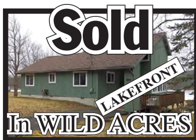
Sold for the Sperandios