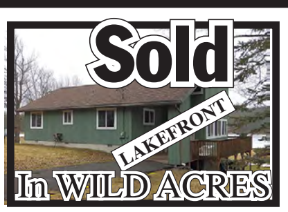
Sold for the Sperandios