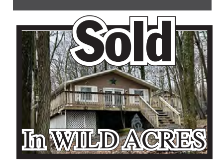
Sold for Benjamin& Campbell