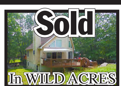
Sold for the Meystelmans