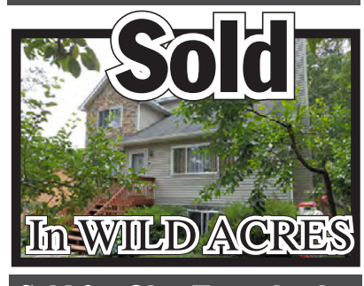
Sold for Olga Tymoshenko