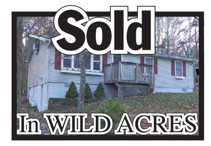
Sold for the Devires