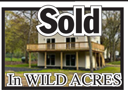
Sold for the Kraminskiys