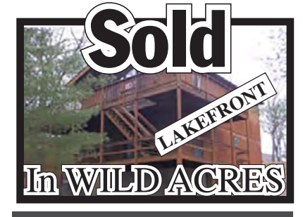
Sold for the Estate of Cattone