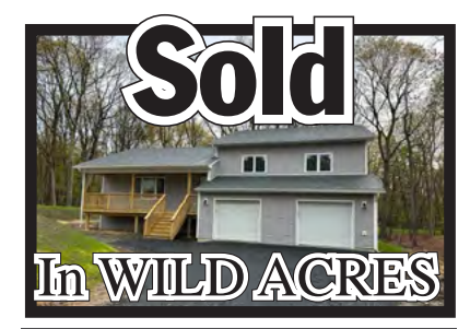
Sold for the Kraminskiys