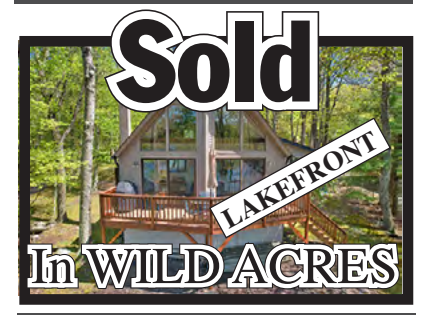
Sold for Kevoian Trust