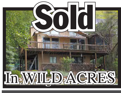
Sold for the Fulgieris